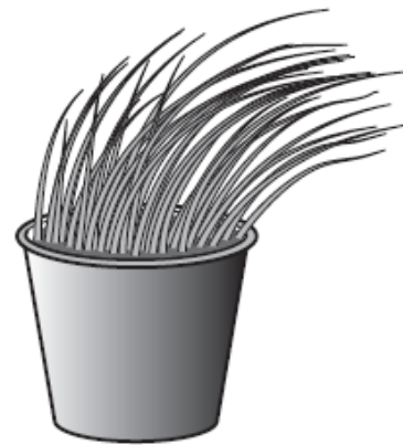
B Grass seeds grown by a window to the side